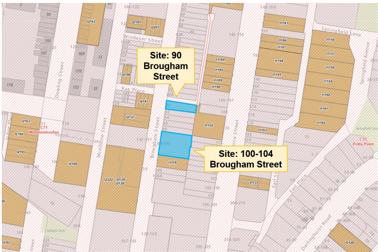
Figure 4. Indicative plan showing the locations of heritage items and the boundary of the heritage conservation area

This planning proposal will not change any heritage controls that are applied to the land.