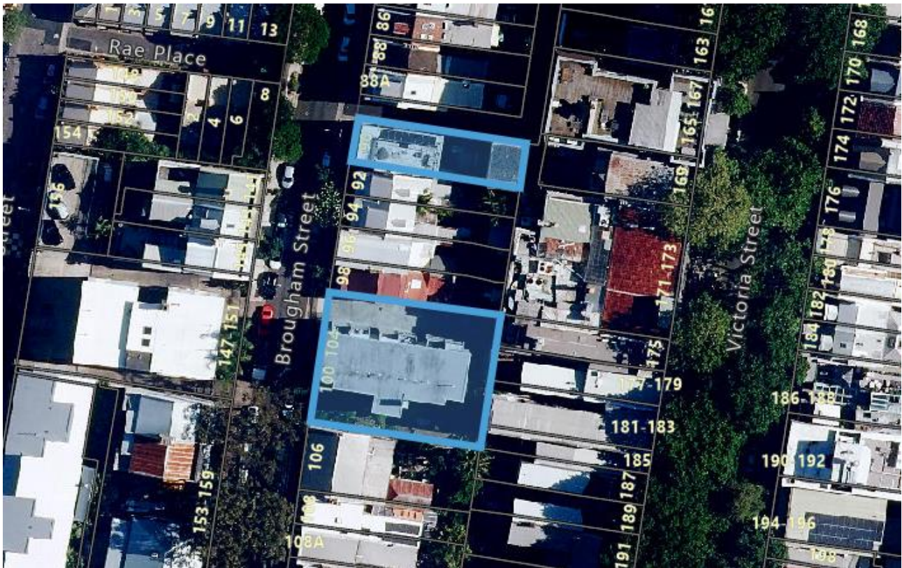
Figure 1. Aerial image showing the site's location

The site is located in Potts Point approximately two kilometres east of Central Sydney. Uses along Brougham Street are predominantly residential, and the most common building type is three storey terrace dwellings with dormer roofs. There is approval for a hotel use at 92-98 Brougham Street, which sits between these two properties.